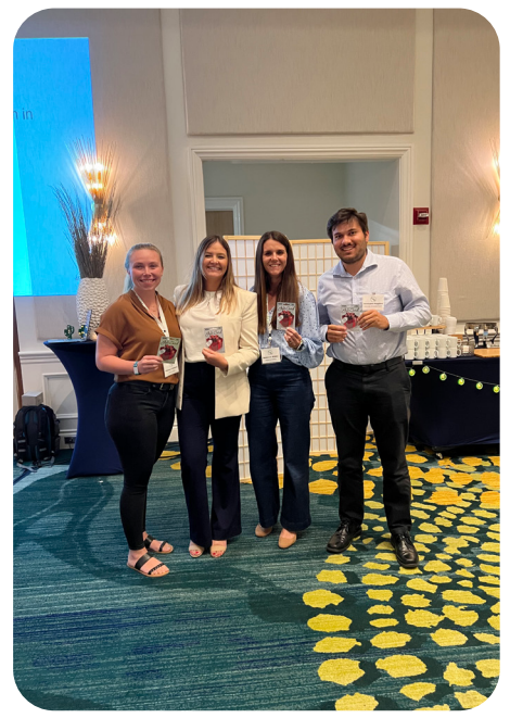
Membrane Machines AKA Kanye Wets