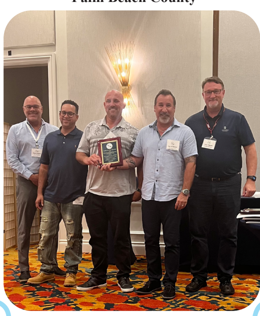
Outstanding Large Plant >5 MGD Palm Beach County